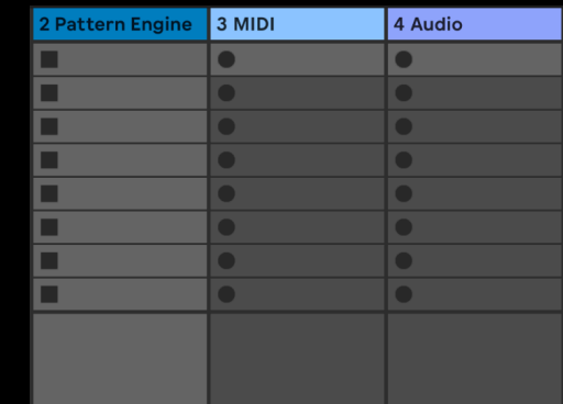
MIDI and Audio tracks set to record output from Pattern Engine